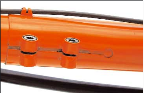
The rear end of the front boon must never be visible in the clamping slot.